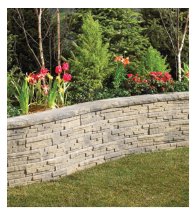
See anchorwall.com for installation instructions.

**If the section is one, two or three courses high, bury one-half of the first course for walls of any size. If the section is four courses or higher, the full first course must be buried.